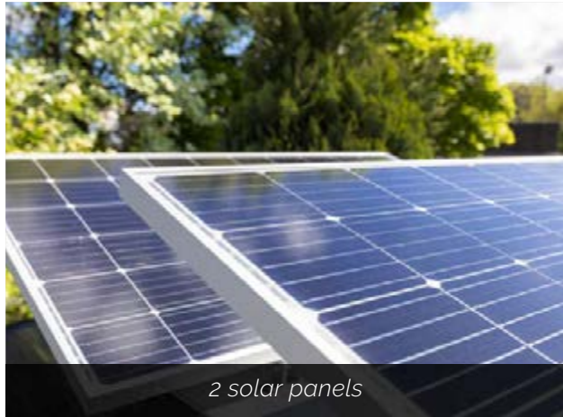
2 solar panels