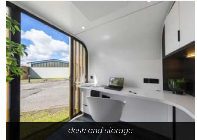
desk and storage